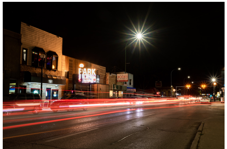
The South Osborne BIZ